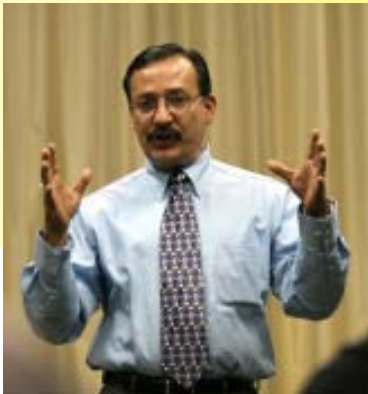
Division of Vocational Rehabilitation Services (left) suggests strategies for employment success.