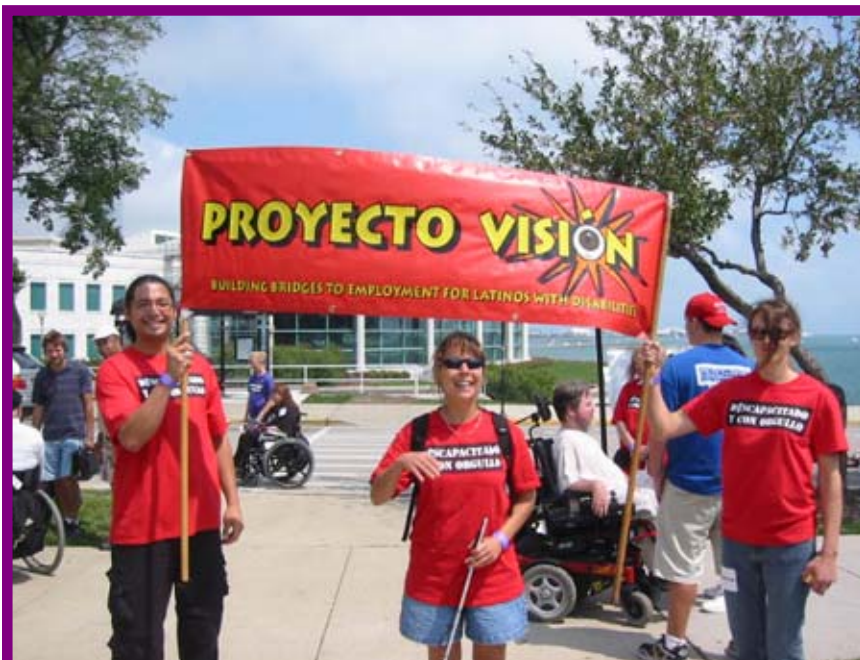
Proyecto Visión staff conduct outreach at a disability pride event in Chicago, Illinois.