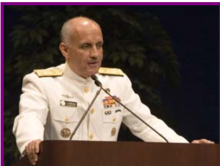
U.S. Surgeon General Richard Carmona emphasizes the power of high expectations. He is a model of success for Latinos around the country.

“What’s the matter with you?...Our people don’t do those kinds of things.” But Carmona held fast to his aspirations, becoming an honor student in college and earning his medical degree.